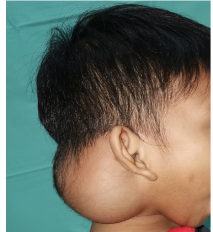
Figure 1. A cystic hygroma typically presents as a soft, nontender, multilocular cystic swelling that is compressible, and fluctuant.

A cystic hygroma typically presents as a soft, nontender, multilocular cystic swelling that is compressible, fluctuant, and