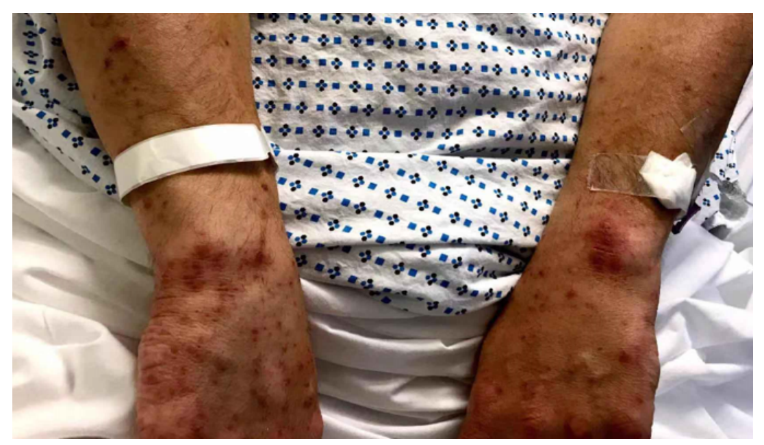
Figure 1. Well-defined, erythematous patches and slightly raised papules and plaques on the patient's hands.

His vitals were stable at presentation. Physical examination revealed numerous well-rounded, targetoid patches and slightly raised papules and plaques on his palms, soles, hands, feet, face, trunk, and extremities ( Figure 1 ). No mucosal involvement was present, and no bullae or vesicles were noted. Results of a CBC revealed an elevated white blood cell count and an elevated ESR.