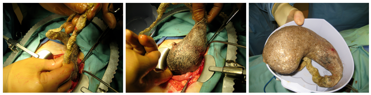
Figure 2. Extraction of the trichobezoar via open laparotomy and gastrotomy.

On further questioning, the patient readily admitted to eating her own hair, and her parents recalled that years prior, she had been evaluated for alopecia of unknown etiology. She was presumptively diagnosed with trichobezoar. She underwent exploratory laparotomy and removal via gastrostomy of a large gastric trichobezoar measuring 18 \times 9 \times 8 cm, with a 45-cm tail, and weighing 820 g ( Figures 2 and 3 ). She simultaneously underwent colonoscopy; results of biopsies were normal.