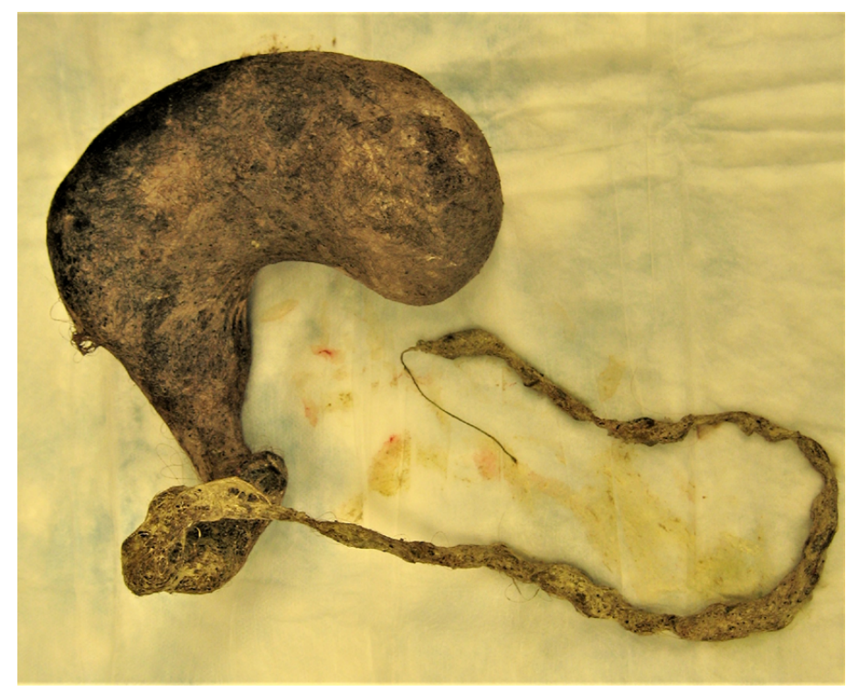
Figure 3. A large gastric trichobezoar was extracted, measuring 18 \times 9 \times 8 cm, with a 45-cm tail, and weighing 820 g.

Discussion. The word bezoar is thought to be a translation of the Arabic gadzehr or the Persian padzahr , meaning "antidote," since historically the bezoars of domesticated animals were thought to have medicinal value in many cultures.<sup>1</sup> There had been very few reports of bezoar-associated disease in humans until DeBakey and Ochsner's cardinal report of approximately 300 cases in 1939.<sup>2</sup>